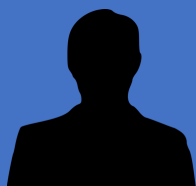
Vacant Youth Representative

This position is vacant. Bio and photo will be updated once the position is filled.