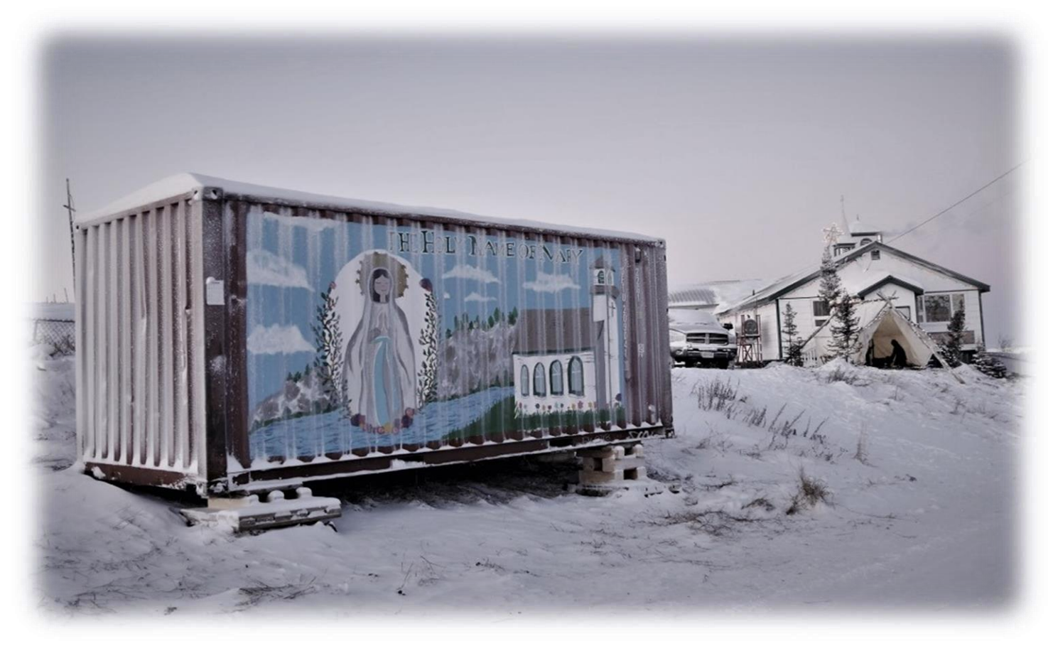
"There is no act of charity that is not accompanied by justice or that permits us to do more than we reasonably can."......Vincent de Paul