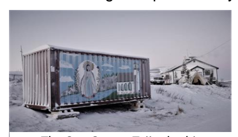
The Sea Can at Tsiigehtchic

Tsiigehtchic and Fort McPherson <a href="https://www.youtube.com/watch?v=cWVI-Ujs0bU">https://www.youtube.com/watch?v=cWVI-Ujs0bU</a> are south of Inuvik and are on opposite sides of the Peel River. St Theresa Parish/SSVP Conference works with these Communities. The sea can was painted last year and permanently placed next to the church in Tsiigehtchic. It is available for storage and distribution of goods provided by the North of 60 Project in the future. Unfortunately, the