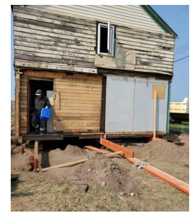
Father's House (1935) in Paulatuk, abandoned for 20 years, now being restored for SSVP food and clothing distribution

The upstairs will become a food and clothing distribution centre. There will be a weekly schedule for opening. Donations of Country Food (fish, goose, whale meat, berries, caribou) from local hunters is expected.