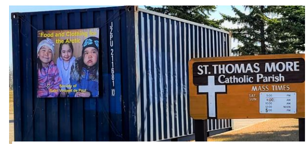
Sea Containers in Parish Parking Lots Raise the Interest of Parishioners

This project is managed by a team of SSVP volunteers. There are no paid employees. Team members are assigned a community. They work