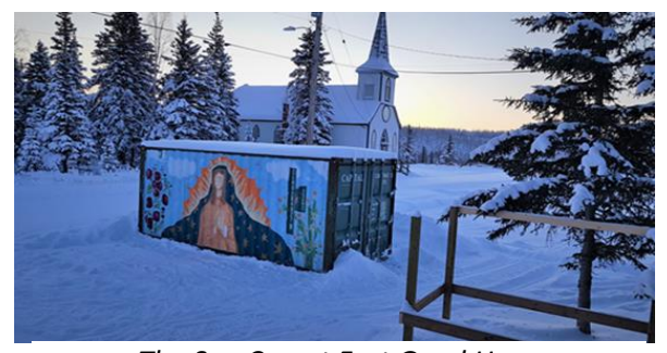
The Sea Can at Fort Good Hope

Fort Good Hope (Kasho Gotine) has a population of 500 and about 10% unemployment.