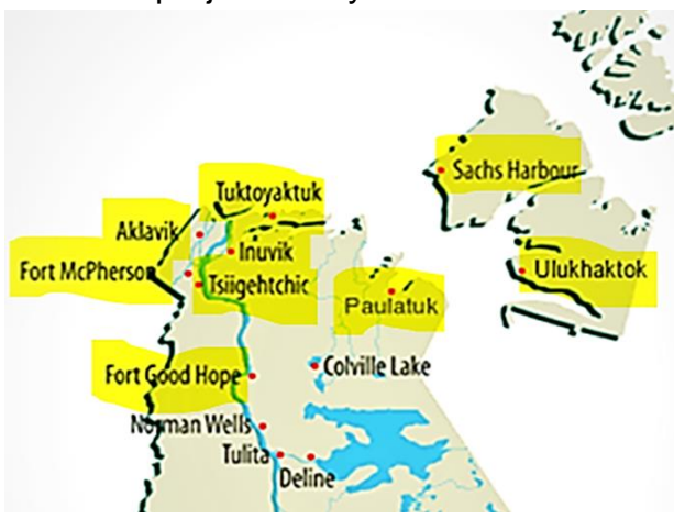
Highlighted are the Arctic Communities served by SSVP Western Region

The Work of Society of Saint Vincent de Paul continued last year as more of a Catholic parish outreach project led by members of our Society at their parish/conference. The reasons to