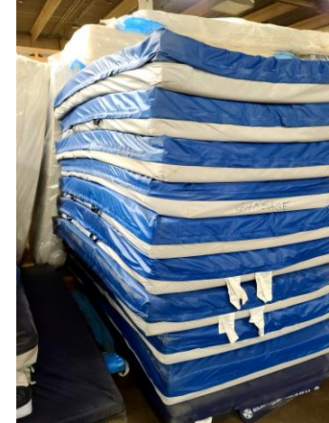
Sleeping Pads from Alberta Health Services

Appendix 2 is a complete list of organizations with which our North of 60 project has established collaboration.