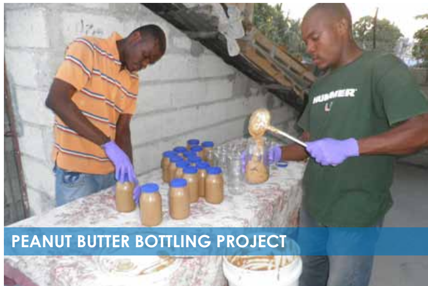
PEANUT BUTTER BOTTLING PROJECT