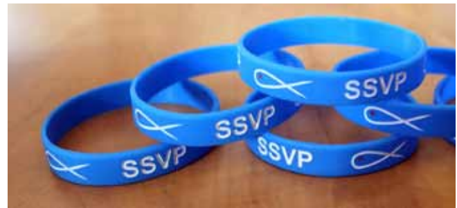
SSVP bracelets - $1.00

See our online catalogue for more information or to order any articles. Visit our website at: www.ssvp.ca .