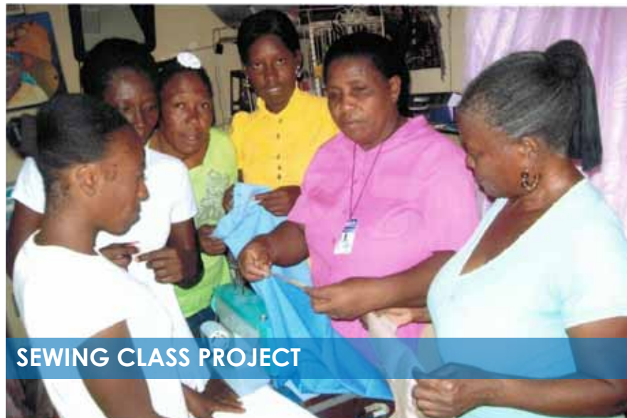
SEWING CLASS PROJECT