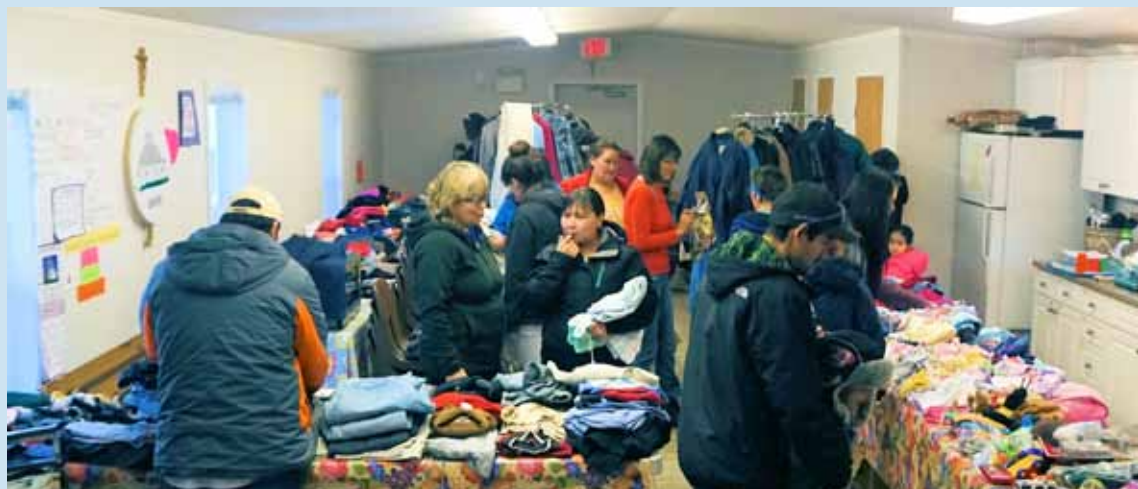
CLOTHING FROM THE SEA CONTAINER BEING DISTRIBUTED IN INUVIK NT