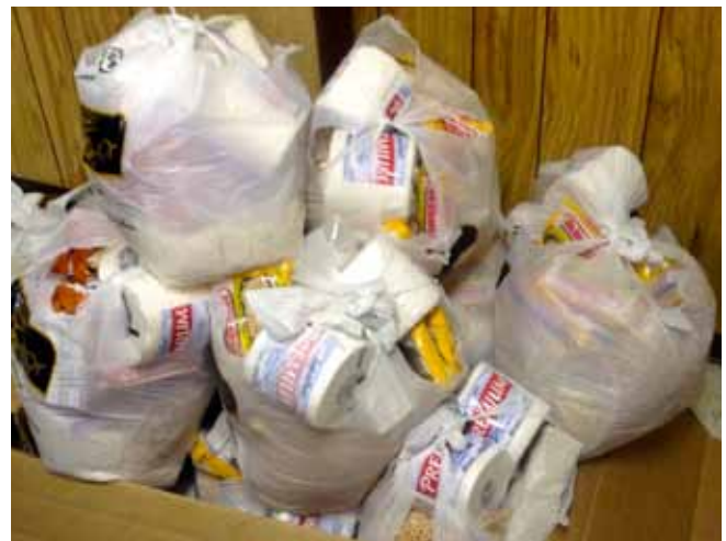
Two week food supply packages prepared and ready to deliver to those in need.