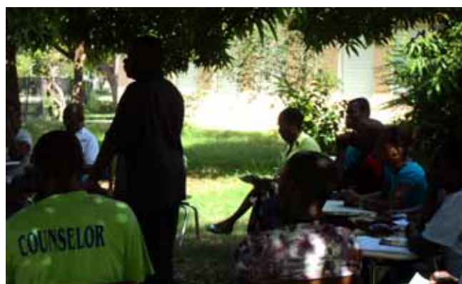
Outdoor classes (second week)