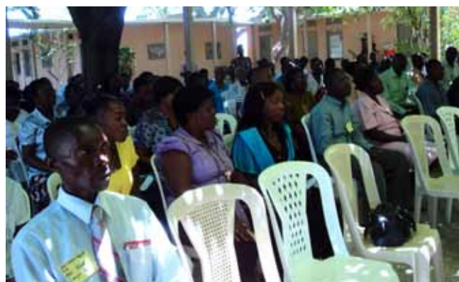
170 participants to the second Sunday mass