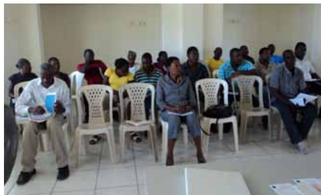
Training in French to 24 trainers (first week)

Jean-Noël Cormier, President National Council of Canada