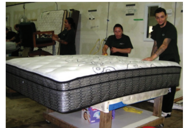
Trainees steaming a mattress to be resold