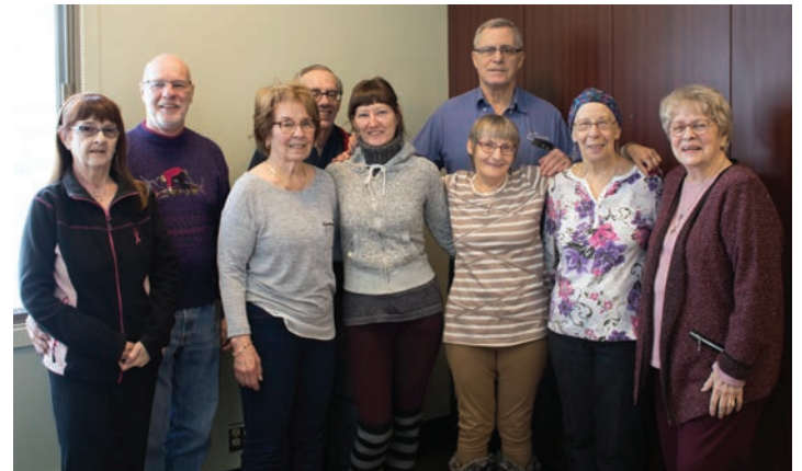
Part of the Thursday morning group of Vincentians and volunteers, at the food bank the "Garde-manger de Rosalie".

FOR THE BENEFICIARIES, VOLUNTEERING IS A GOOD WAY TO FEEL USEFUL, VALUED, AND TO HAVE REGULAR SOCIAL INTERACTIONS.