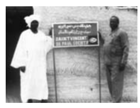
Humanitarian support in Darfour

larly England & Wales, Ireland and Scotland) and other organisations. We have chosen to describe the work of our Society in Darfur, an area particularly at risk at the moment.