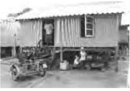
A new house for a Thai family