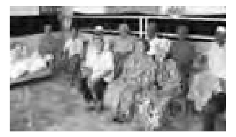
A group of Muslim affected people helped by SSVP

provide boats and tools to fishermen and workers, in repairing or constructing houses and helping children with their education.