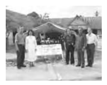
National President and the International Structure visiting a temporary school

The Medical component of the project would involve giving medical care to 20 patients, over 6 months at a cost of 15,550 Euros.