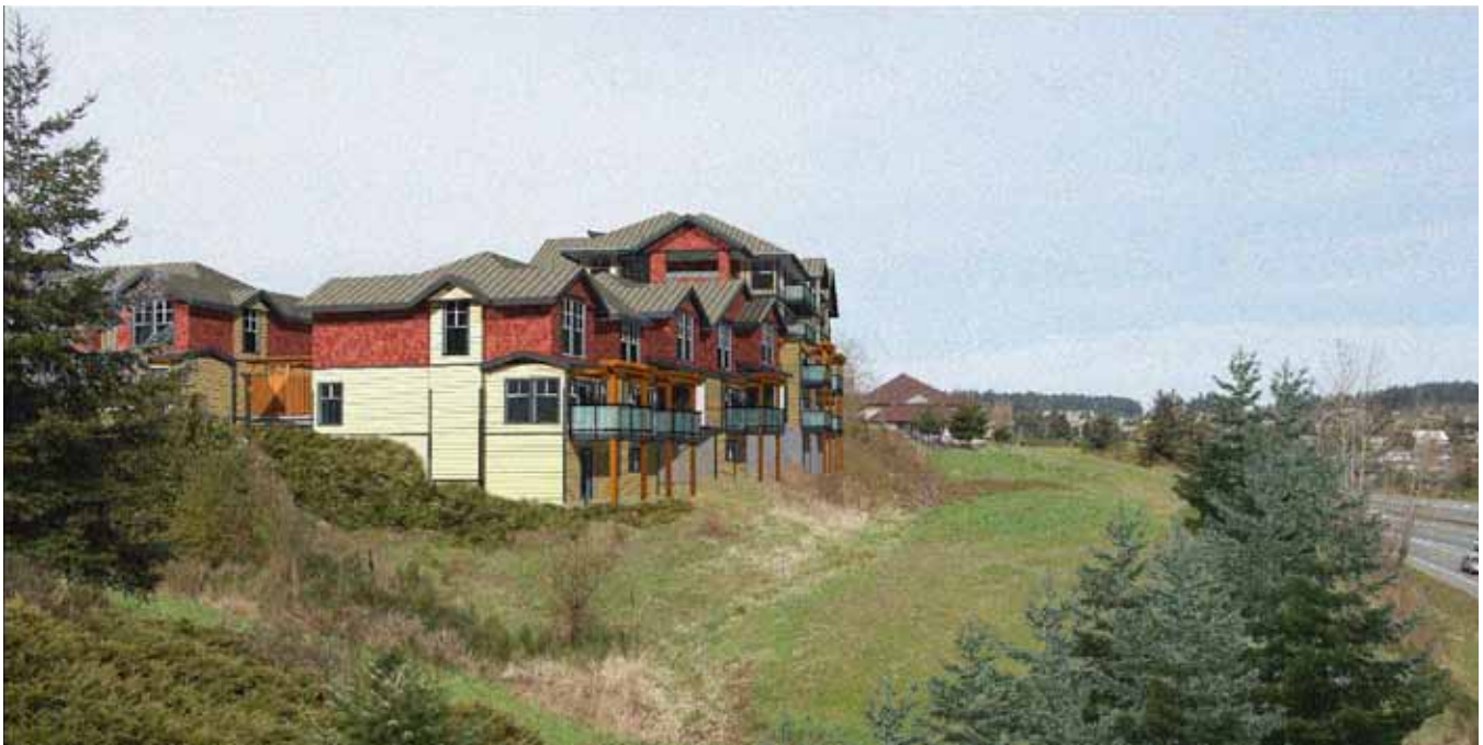
Looking North-East towards proposed development