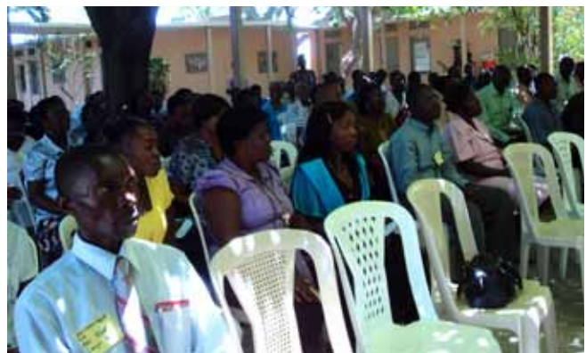
170 participants to the second Sunday mass