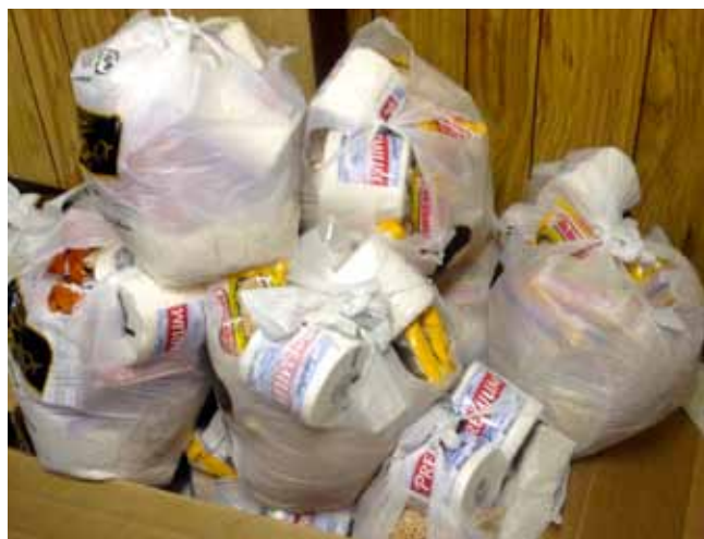
Two week food supply packages prepared and ready to deliver to those in need.