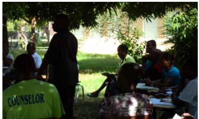
Outdoor classes (second week)