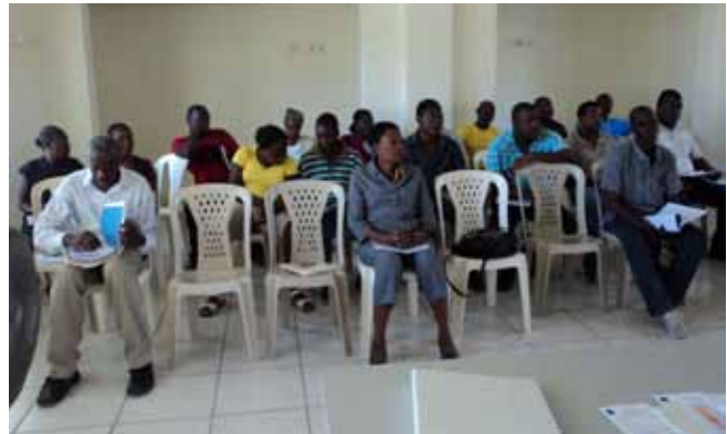
Training in French to 24 trainers (first week)